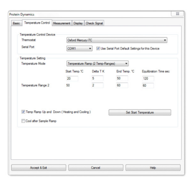
Figure 2. Screen capture of the temperature control user interface in Bruker's OPUS software (optional O/PRO package).