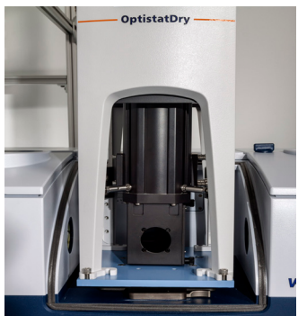
Figure 1. Optistat Dry mounted in a Bruker V70 FTIR spectrometer.

The Bruker VertexFM infrared spectrometer can cover the full spectral range, from 30 wavenumbers to 6,000 cm<sup>-1</sup> in a single scan. While a bolometer is ideal for conducting measurements in the far infrared (FIR), due to it having much greater sensitivity than a DTGS detector, most samples can be analysed with a DTGS detector due to the high sensitivity of the Vertex FTIR spectrometers. This is particularly attractive in utilising the VertexFM configuration that has a DTGS detector with a diamond window to cover the NIR-FIR spectral range. The Optistat Dry can be configured with optical windows suitable for the spectral range of interest. The windows can be easily exchanged as the sample chamber is readily accessible.